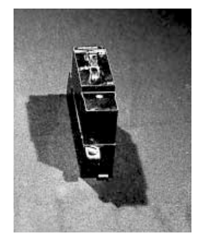
Figure 13.2. Circuit Breaker. This breaker is typical of many installed in lighting circuitry. It is a combination heat and magnetic sensing breaker. When installed, only the top, which resembles an ordinary electrical switch, is visible. When it opens, the switch handle moves to a center position between "on" and "off." To restore power, turn to "off" then to "on." Breakers should not be used for day-to-day control of loads.